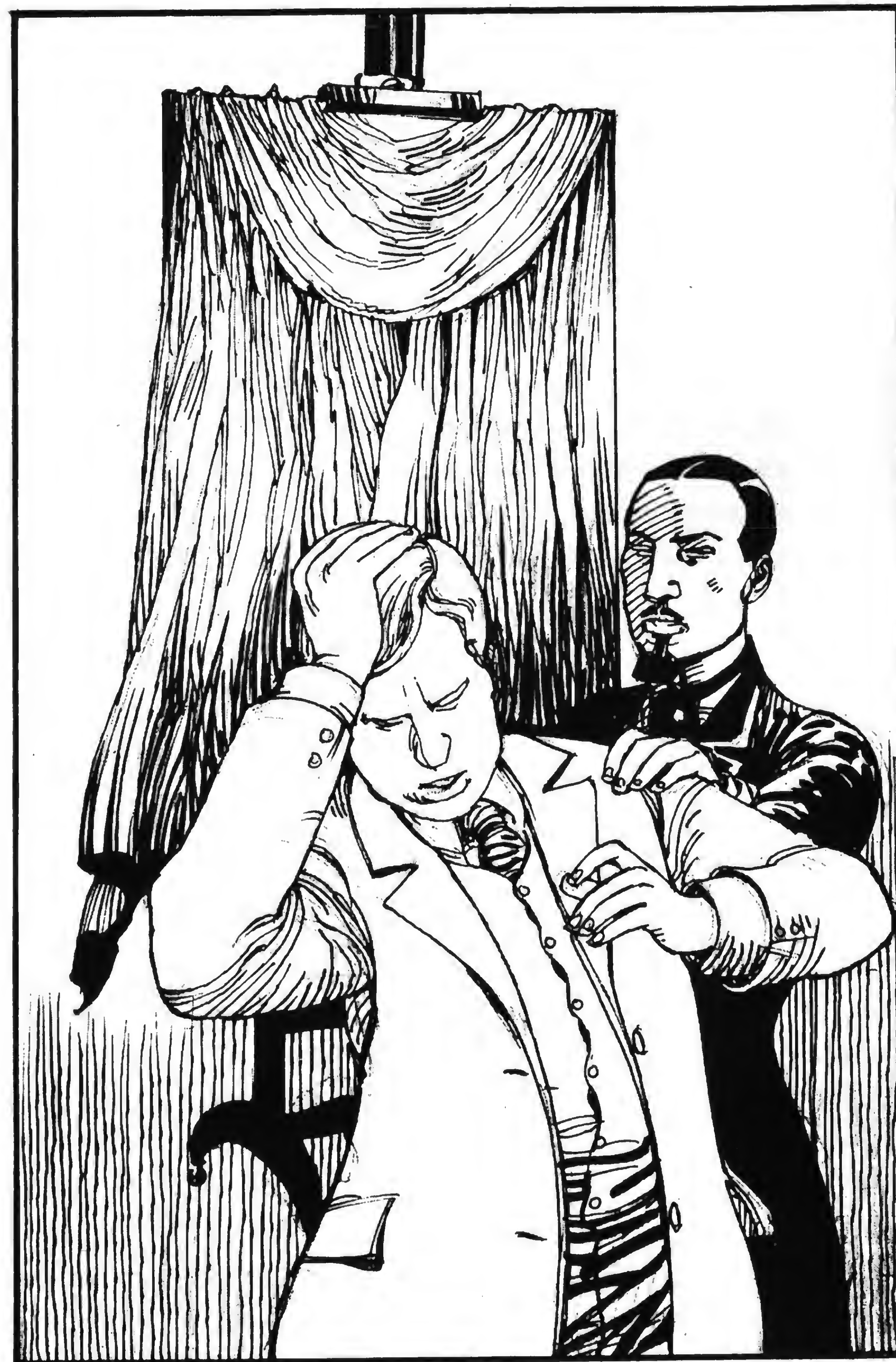
A cry of pain came from the boy's lips and he jumped to his feet. 'Dead! Sibyl dead! It is not true! It is a horrible lie!'

They were silent. The evening darkened in the room. After some time Dorian Gray looked up. 'How well you know me! But we